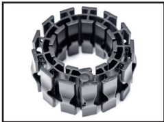
Snap fit band