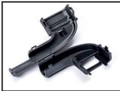
Connector strain relief